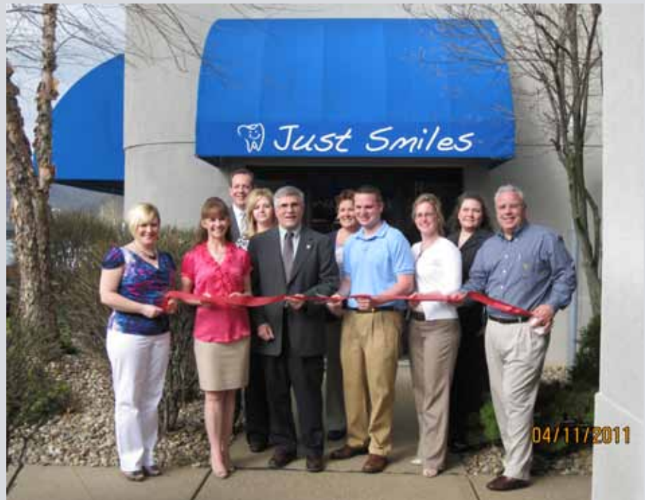
JUST SMILES ribbon cutting.